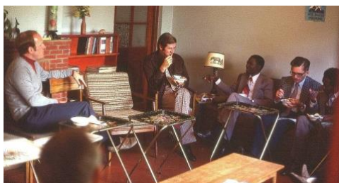
ACTEA visit to Scott Theological College in Machakos, Kenya (July 1979)

From 1976–2014, ACTEA lacked a permanent home. While ACTEA remained faithful to its calling, often overcoming nearly insurmountable odds to do so, the ACTEA office was simply wherever the current ACTEA director happened to sit down with his briefcase – sometimes South Africa, sometimes Nigeria, sometimes Zambia, sometimes abroad in the United States. In 2013 the Council resolved to move the office permanently to Nairobi, Kenya, where AEA, ACTEA's parent organization, is located. So in 2014, for the first time ACTEA acquired a permanent office. Becoming officially registered as a non-profit society, ACTEA was able to establish a permanent office, sharing a corner in AEA's old offices in Nairobi. In September 2017, we moved to a larger space in a small outbuilding on the campus of Nairobi Evangelical Graduate School of Theology (NEGST; now part of Africa International University/