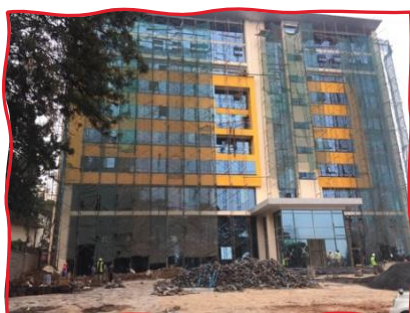
AEA Plaza, under construction