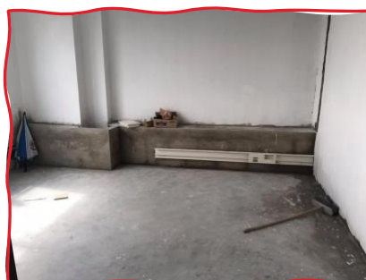
Executive Director's Office