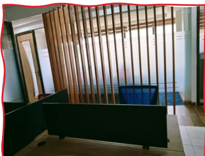
Hallway view from Workstations